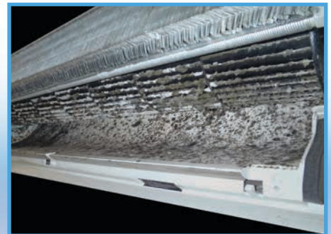
Mold thrives on mini-split blower wheels